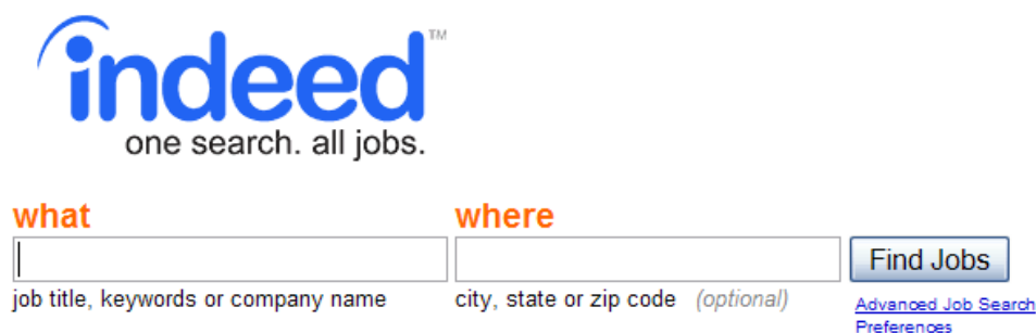
A clear search interface on Indeed.com

A Search Interface is the place where you start your search. It is made up of at least a text input field and a search button. Below you see the Search Interface of Indeed.com with 2 input fields and one search button with the text "Find jobs".